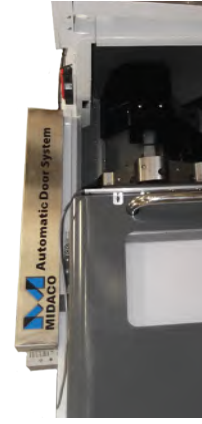
For Single Doors from 18" to 62" (457.2mm to 1574.8mm)