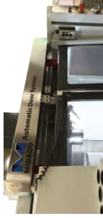
For Double Doors from 18" to 150" (457.2mm to 3810mm)