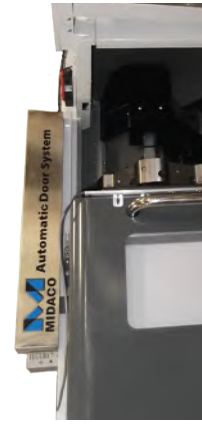
For Single Doors from 18" to 62" (457.2mm to 1574.8mm)